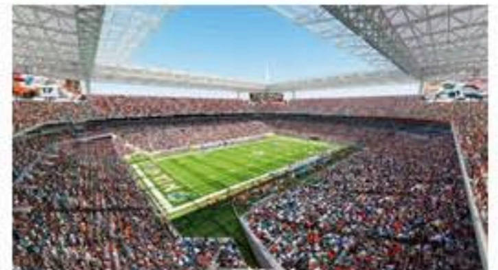
Dade Commissioners Send Sun Life Stadium Deal to Voters