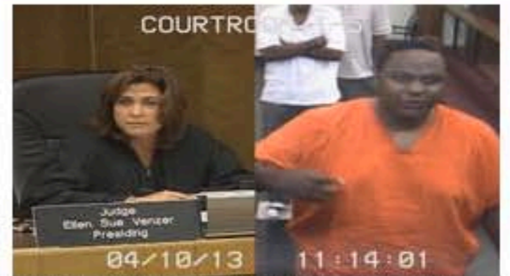
WATCH: Man Facing Battery Charge Curses Out Judge