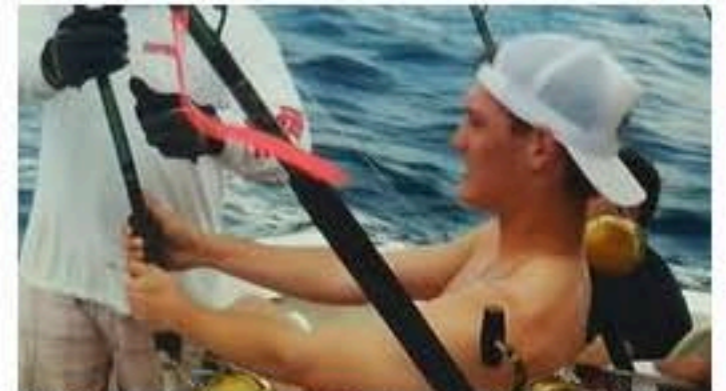
WATCH: College Students Catch Great White Shark